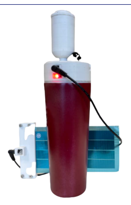
Figure 4. 3-in-1 Solar Aqua Tech water bottle in operation with prefilter powered by a solar panel.

The team collectively used their artistic talents to make the SAT water bottle functional and attractive. The stainless-steel bottle with the 3D-printed cap was painted with RHS's color, maroon. A laser engraver was used to etch a custom logo. Figure 4 shows the "3-in-1" SAT prototype water bottle in