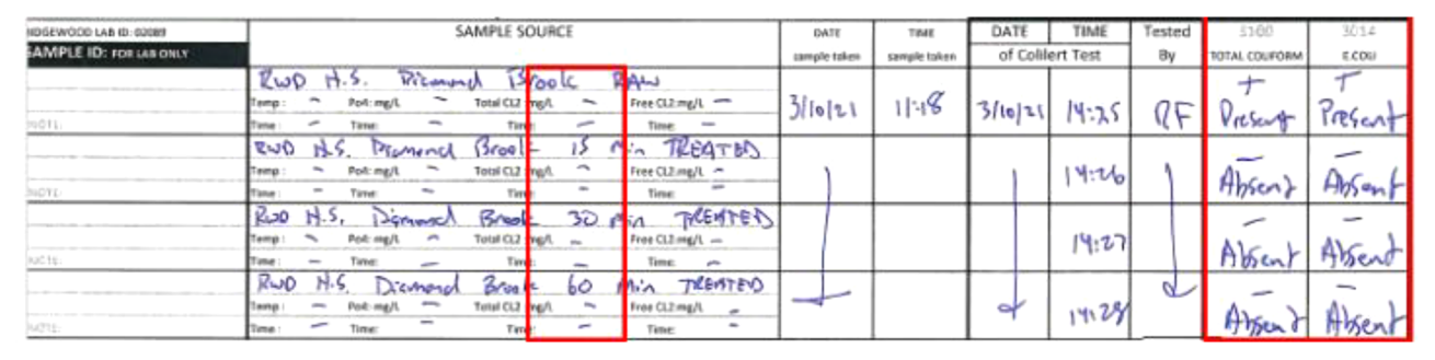
Figure 3. Diamond Brook water bacteria certificate: certified Total Coliform-free and E. coli-free.

Journal of Chemical Education Article pubs.acs.org/jchemeduc