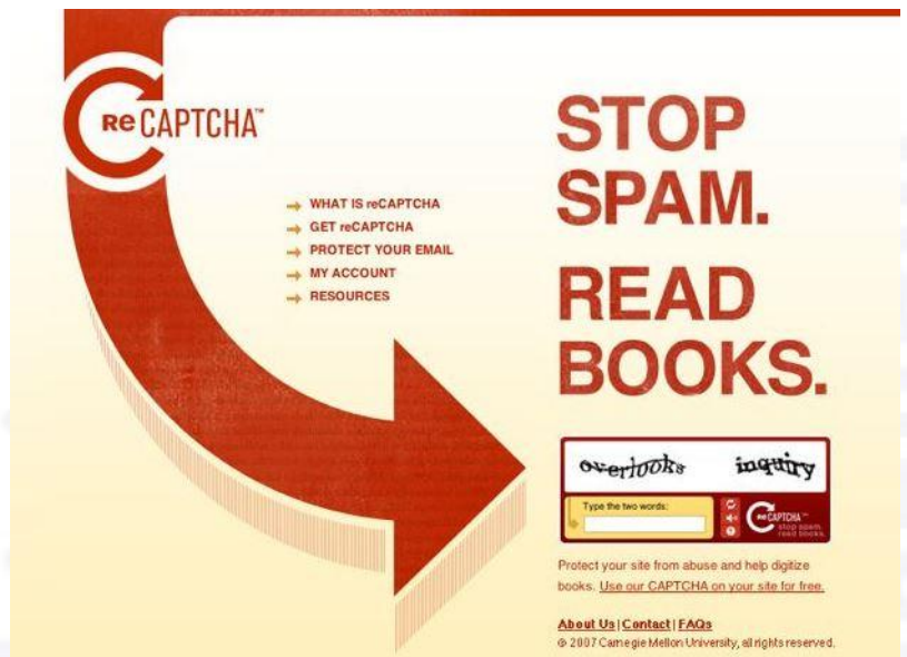
reCAPTCHA is both a security check and a text digitization program.

Von Ahn received a $500,000 MacArthur Foundation grant in 2005 as a new computer science professor at Carnegie Mellon. Advancing the concept that the human brain can work through problems that computers cannot yet solve, he built reCAPTCHA, a cybersecurity tool similar to CAPTCHA. Von Ahn developed an efficient system with reCAPTCHA, where users decipher one distorted word from scanned text, which was unrecognizable by computers, as part of an online security check. These deciphered words could then be used in the digitization of books, newspapers, maps and AI challenges. Internet users decoded several million CAPTCHAs on a daily basis, equivalent to 500,000 hours of work each day. Von Ahn sold his second invention to Google in 2009, joining the company for the next two years while on leave from Carnegie Mellon. ReCAPTCHA has facilitated the digitization of about two million books per year from the Google Books project, and more than 13 million articles in The New York Times archives dating back to 1851. This has helped make historical works previously confined to specific physical library locations widely available online, opening up possibilities for research and ensuring long-term digital access to a wide range of people.