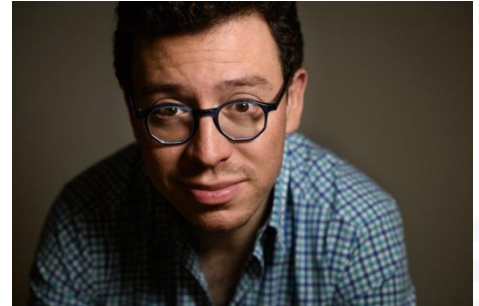
Luis von Ahn

Luis von Ahn, the inventor of reCAPTCHA and co-inventor of CAPTCHA, set out to fight socioeconomic disparities by breaking down barriers to education. He co-founded Duolingo in 2011, a platform bringing free and accessible language-learning to everyone, helping to remove obstacles to social mobility across the globe. Von Ahn received the Lemelson-MIT Prize in 2018 for his groundbreaking inventions, commitment to youth mentorship, and dedication to improving the world through technological invention.