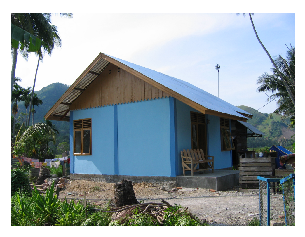
Confined masonry is the most commonly preferred structural system by homeowners in Aceh, Indonesia, shown here. In partnership with a team of pro bono structural engineers, Build Change performed engineering analysis and developed confined masonry structural design drawings for this typical single family house.

While building techniques and materials used vary by location, to ensure successful implementation and sustainability, Build Change has identified three critical factors, or "The Three C's," for durable, culturally acceptable and affordable reconstruction, outlined below.